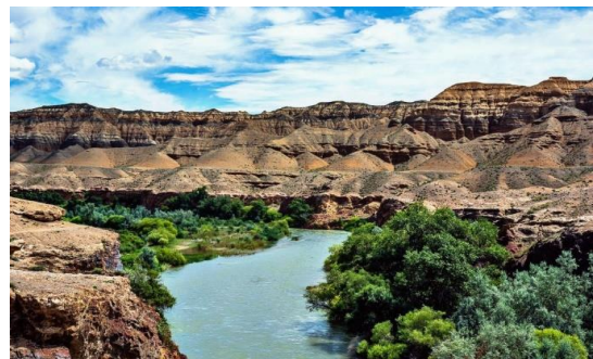
Ash grove in the valley of the Charyn River